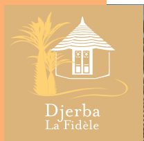
Djerba La Fidèle