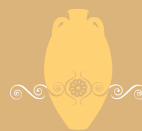
Djerba La Douce